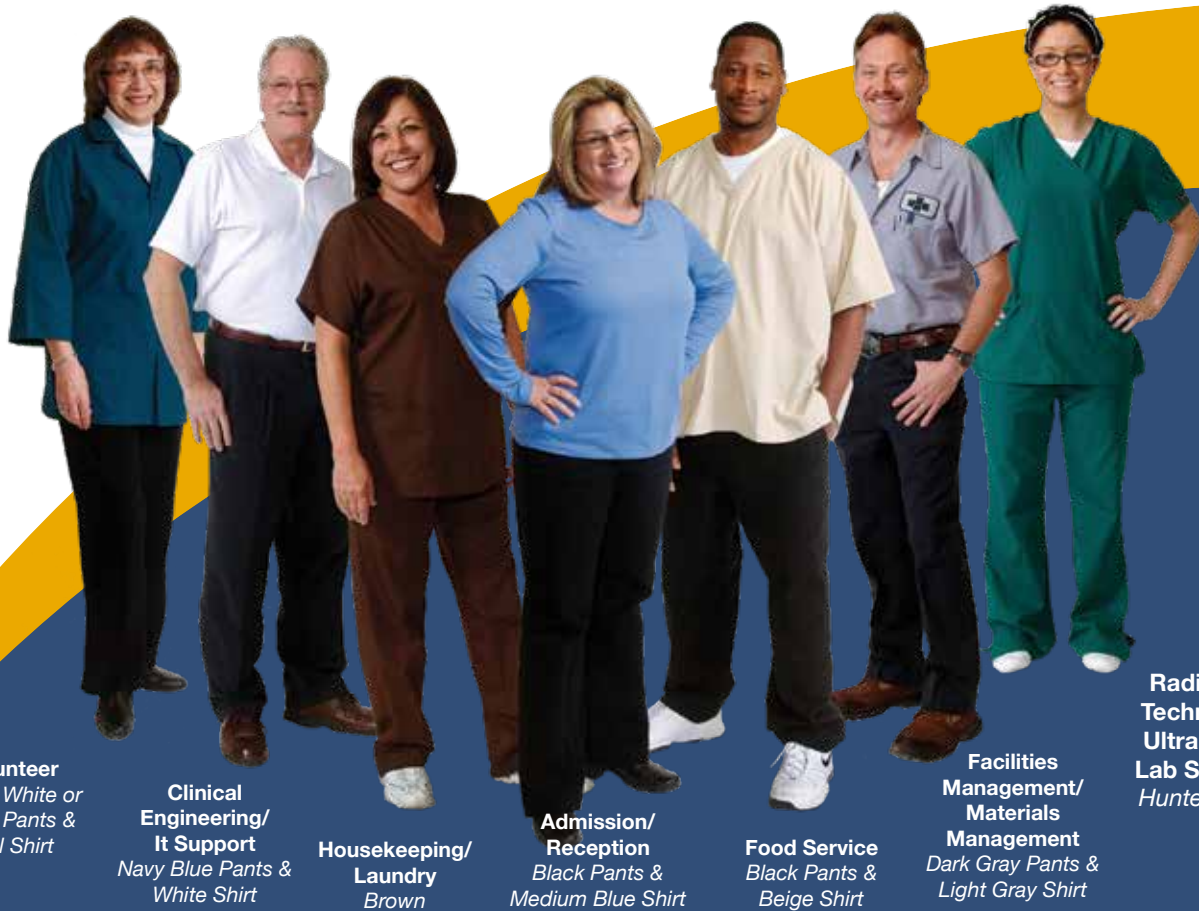
Volunteer Black, White or Khaki Pants & Teal Shirt