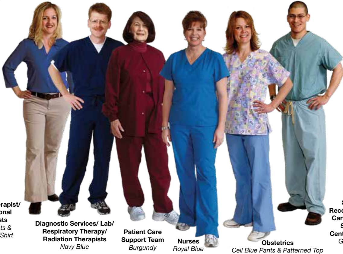
Physical Therapist/ Occupational Therapists Beige Pants & Navy Blue Shirt