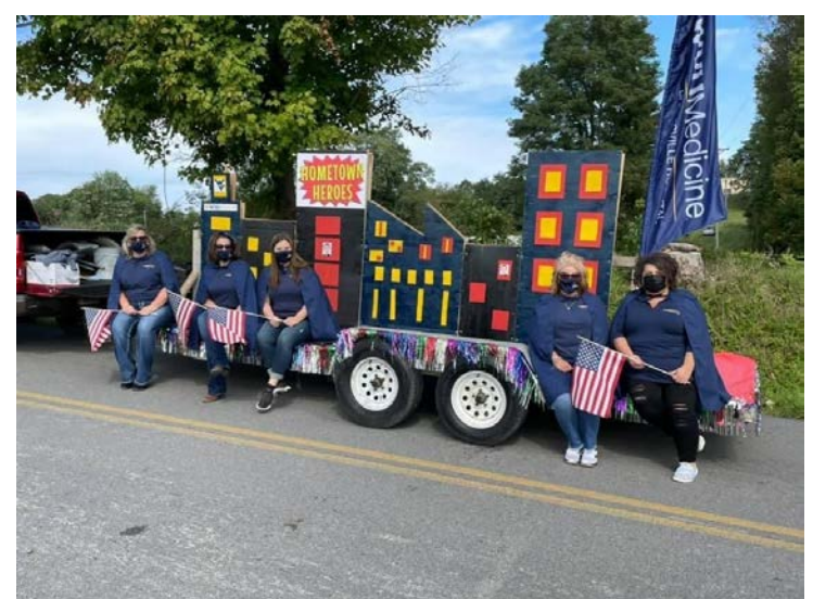
A big thank you to the Barnesville Pumpkin Festival Committee for putting on an amazing event!