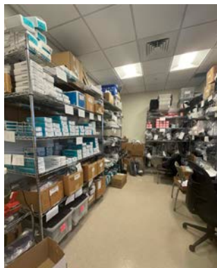
DME Closet at UTC Clinic