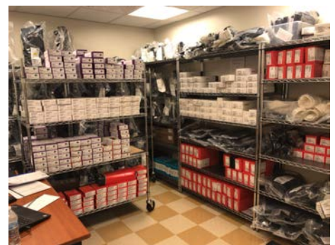
DME Closet at UHC