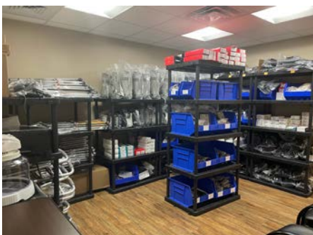
DME Closet at Wheeling Hospital

Allied Health Solutions DME has been in a rebuilding phase for the past 8 months. Throughout this period AHS DME has concentrated on improving legacy processes and procedures as well as building the Respiratory referrals and Orthopedic closet space. To date, since December 2020, AHS DME has placed DME supplies in 5 new closets with 15 in the works to go in by Q4 2021. The DME closets are a revenue source not recognized fully prior to 2021 and they complement our current opportunities to touch and improve many patients' lives. DME closets can be seen anywhere from Emergency Departments to Urgent Care clinics and Orthopedic Surgeon offices. As Allied builds these closets within our health system, we are reducing the hospitals' non-reimbursable spend and adding revenue back into the WVUHS network. If you have any comments or opportunities, please feel free to reach out to Allied Health Solutions DME.