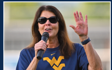
Special thanks to the Human Resources Department for organizing the event and to Plant Operations for delivering tables & chairs, and setting up tents.