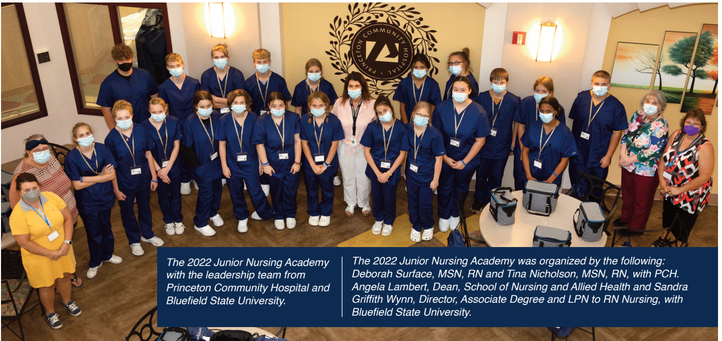
The 2022 Junior Nursing Academy with the leadership team from Princeton Community Hospital and Bluefield State University.