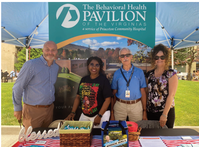
Special thanks to The Pavilion and all who participated in the Juneteenth Freedom and Heritage Celebration in Downtown Bluefield on June 20! It was a great event enjoyed by all!