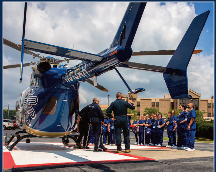
To cap off the final day of the Junior Nursing Academy, HealthNet Aeromedical Services landed a helicopter at PCH for the students to tour.