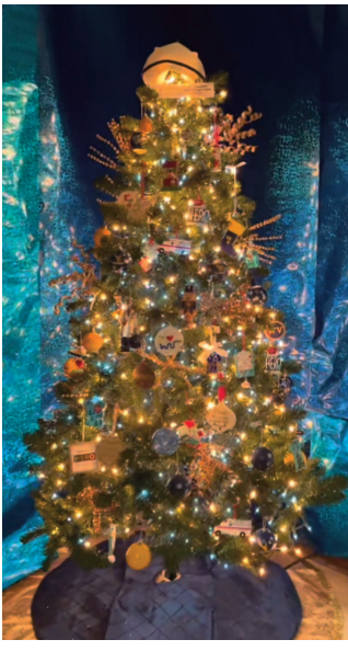
The Pavilion was the winner of the Tree Decorating Competition with 329 votes! Congratulations!