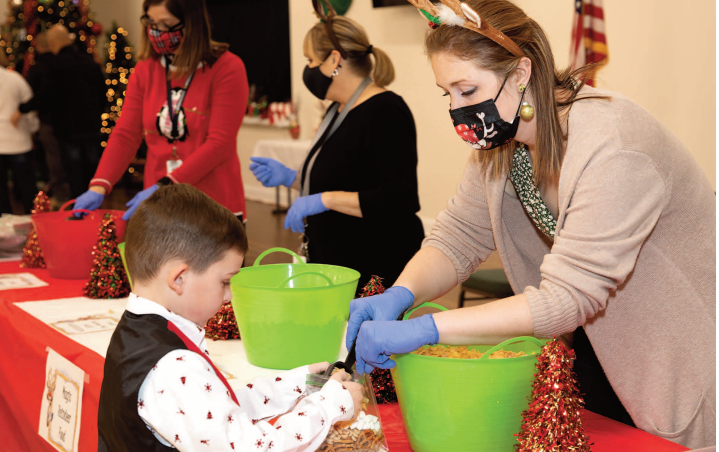
Although hampered by COVID, the holidays were still a festive time this year with a special employee luncheon, An Evening with Santa , tree decorating and ugly sweater contests, 12 Days of Giving , and much more! We hope everyone had a wonderful holiday and we wish you all the best in the new year!